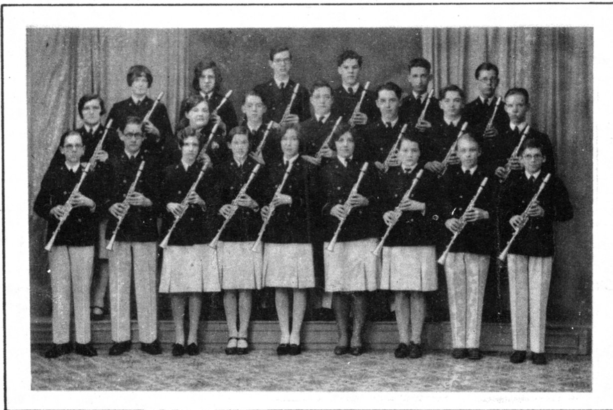
CLARINET SECTION OF THE LOCKPORT HIGH SCHOOL BAND WITH Silva-Bet CLARINETS