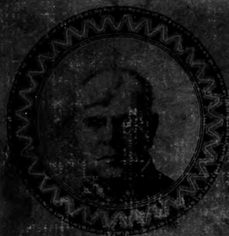
John Philip Sousa CONDUCTOR