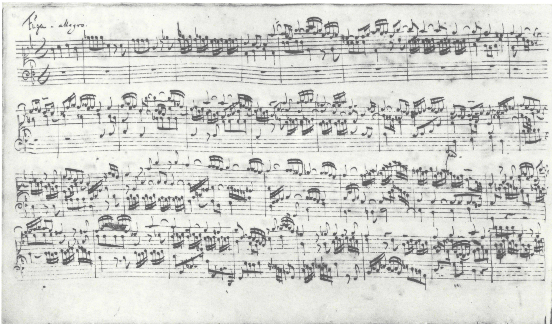
Praeludium et Fuga in g (Fragment), BWV 535a. Autograph.